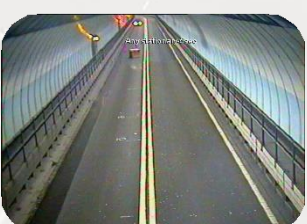
Object on Road