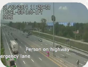
Person on Road